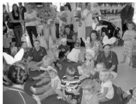
Culburra Beach pre school Easter hat day