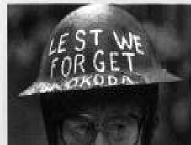
THE ANZAC TRADITION

We are all immensely proud of the project, of how it looks and what it stands for. We encourage all the community to share in that pride and protect it. Please consider attending the dawn service on Anzac Day. Please also consider taking time to visit the park on completion. Enjoy the view and the facility that is our Anzac Park.