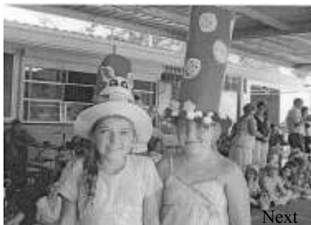
Easter hat day photo

The Students of Greenwell Point had a great time for Easter and successfully raised $70.30 for the Cancer Council by having a pink and yellow mufti day. The students enjoyed a church service, barbecue lunch and a Easter hat parade, with all children receiving an Easter egg for participating.