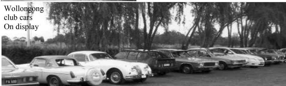
Wollongong club cars On display

Wollongong members also showed an interest in the historical memorabilia on display in the small museum.