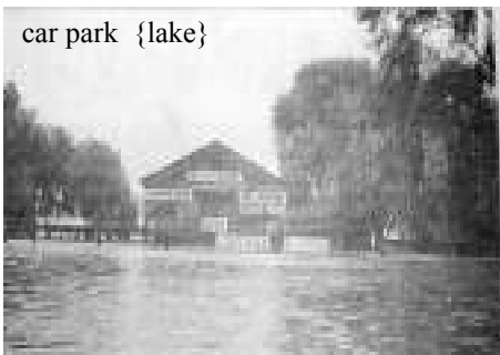
car park {lake}

Although threatening, the weather was kind for the Wollongong Veteran car club's day out. The club enjoyed a picnic lunch at the historic Jindyandy Mill.